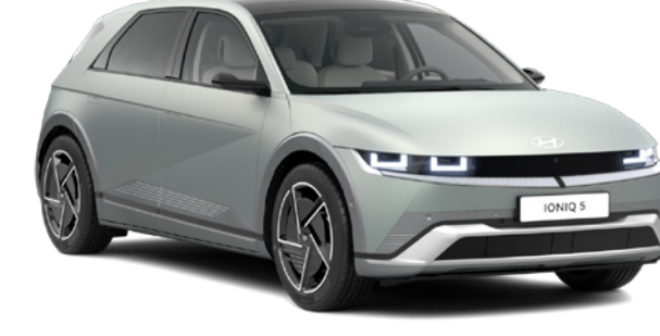
Celadon Grey* (Matte)

All colours are an additional cost option except from Ultimate Red (Metallic). *Colours only available on Advance, Premium and Ultimate.