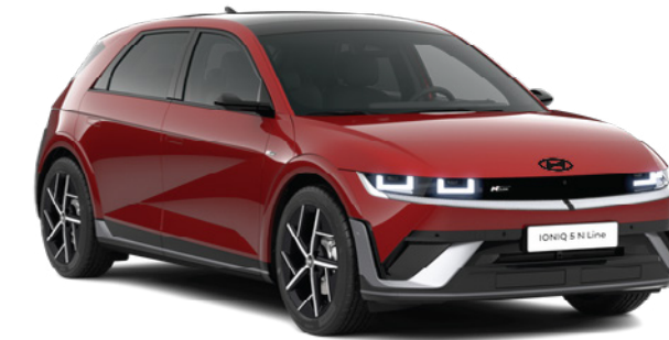
Ultimate Red (Metallic) (No cost option)