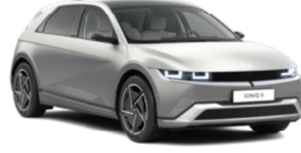
Gravity Gold* (Matte)