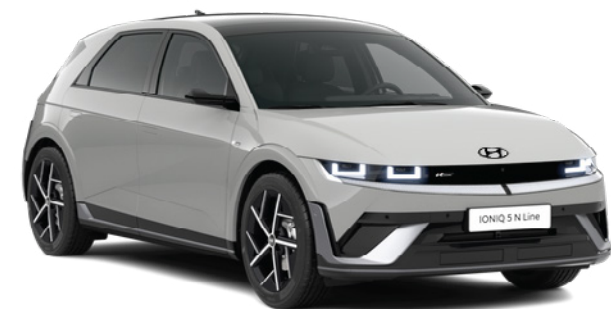
Cyber Grey (Metallic)