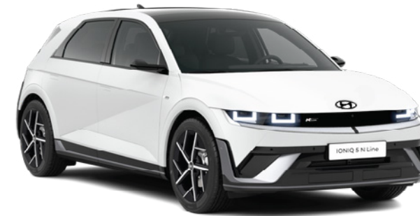
Atlas White (Matte)