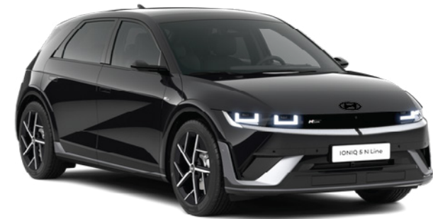
Abyss Black (Pearl)

Choose from a wide range of exterior colours to create an IONIQ 5 that is best matched to your personal style.