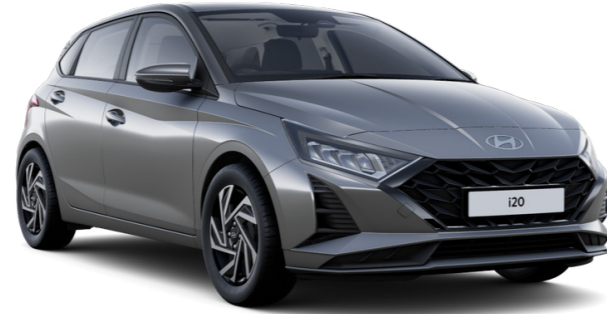
Lumen Grey (Pearl)*