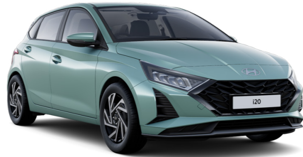
Mangrove Green (Pearl) (No cost option)