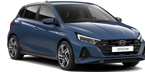
Vibrant Blue (Pearl)*