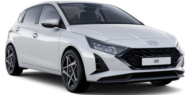
Atlas White (Solid)*