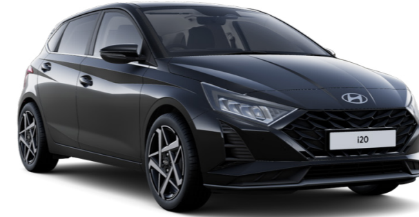
Phantom Black (Pearl)*