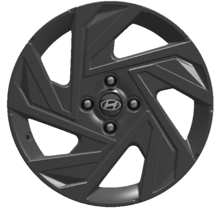
16" Black Alloy Wheel