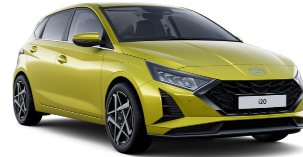
Lucid Lime (Metallic)*

*Colour shown and computer screen resolutions may not reflect the vehicle colour in real life. For guidance only.