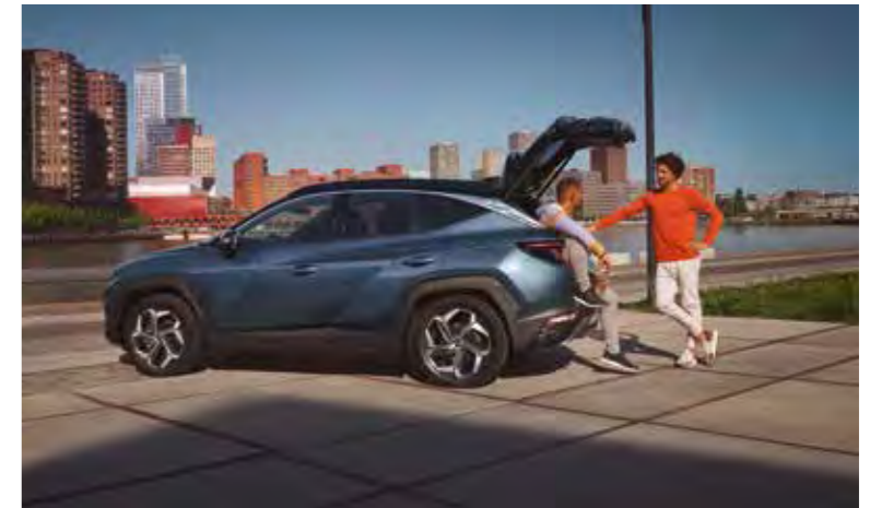
Car shown: TUCSON Hybrid Premium in Dark Teal Metallic. Car shown is not to UK Specification.

Dynamic design combined with advanced technology for the drive of tomorrow, today.