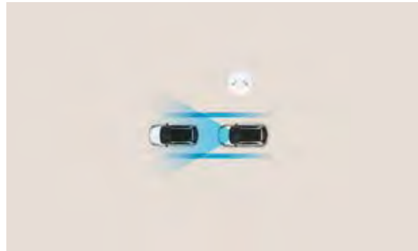
Lane Follow Assist (LFA): LFA helps prevent accidental lane departure and keeps your vehicle safely centered within the lane. Using a forward camera to recognise the intended lane, LFA will automatically provide corrective steering input to help maintain the centre path. This not only detects road lines but also the road edge.