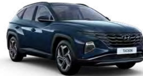
Dark Teal Metallic* Not available on N Line or N Line S.