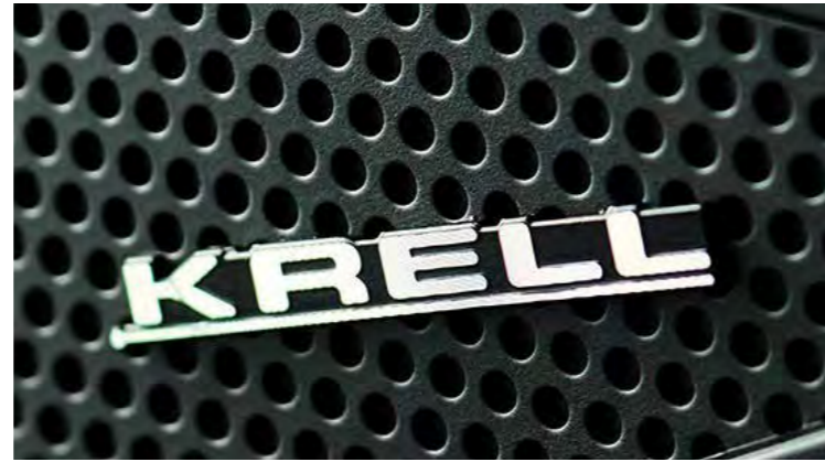
*KRELL premium audio standard on N Line S, Premium and Ultimate trims.

The TUCSON offers connectivity that is second to none. Front and centre, the 10.25" Supervision Cluster and 10.25" touchscreen Audio Visual Navigation units give full control of on board systems at your fingertips. Mobile connectivity allows multiple handsets to be connected via Bluetooth®. Smart Voice Interaction gives you integrated vehicle control, and wireless smartphone charging** means you're cable-free. Our on board KRELL* sound system features eight custom speakers to provide an immersive audio experience. Bluelink® connected car services includes Last Mile Navigation and a new user profile feature. Users can locate their vehicle or view vehicle attributes like fuel level, via the Bluelink® app.