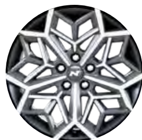
19" Alloy Wheels.