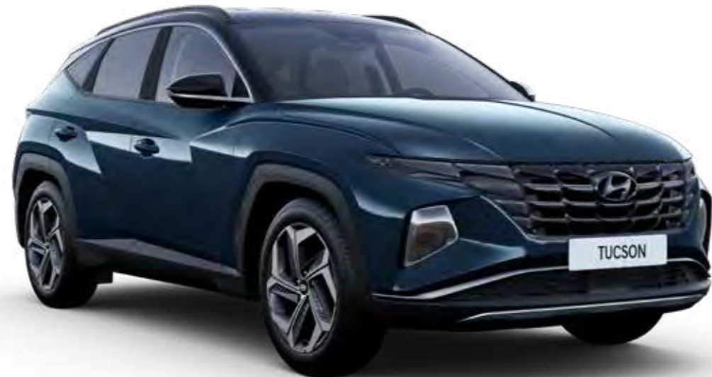
Car shown: TUCSON Hybrid Premium in Dark Teal Metallic with Black two-tone roof.