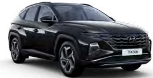
Dark Knight Grey Pearl*