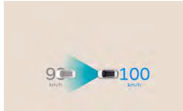
Smart Cruise Control (SCC): Automatically takes road features into account and adjusts your speed to maintain a safe distance from the vehicle in front.

Safety starts outside the vehicle. With a complete safety package*, the TUCSON's Collision Avoidance systems warn of hazards on all sides, including blind spots, to protect you and your passengers. The new Safe Exit Warning (SEW) function alerts occupants if there is oncoming traffic when they attempt to step out of the car.