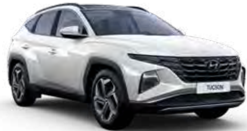
Atlas White Solid*