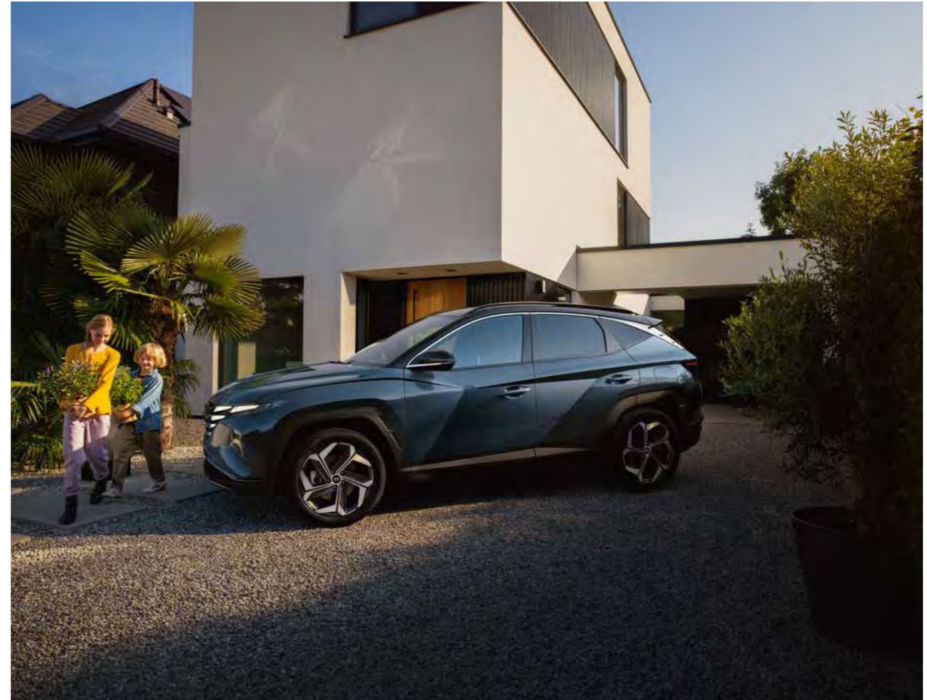
Car shown: TUCSON Hybrid Premium in Dark Teal Metallic with optional two-tone roof and interior colour pack. Car shown is not to UK specification.