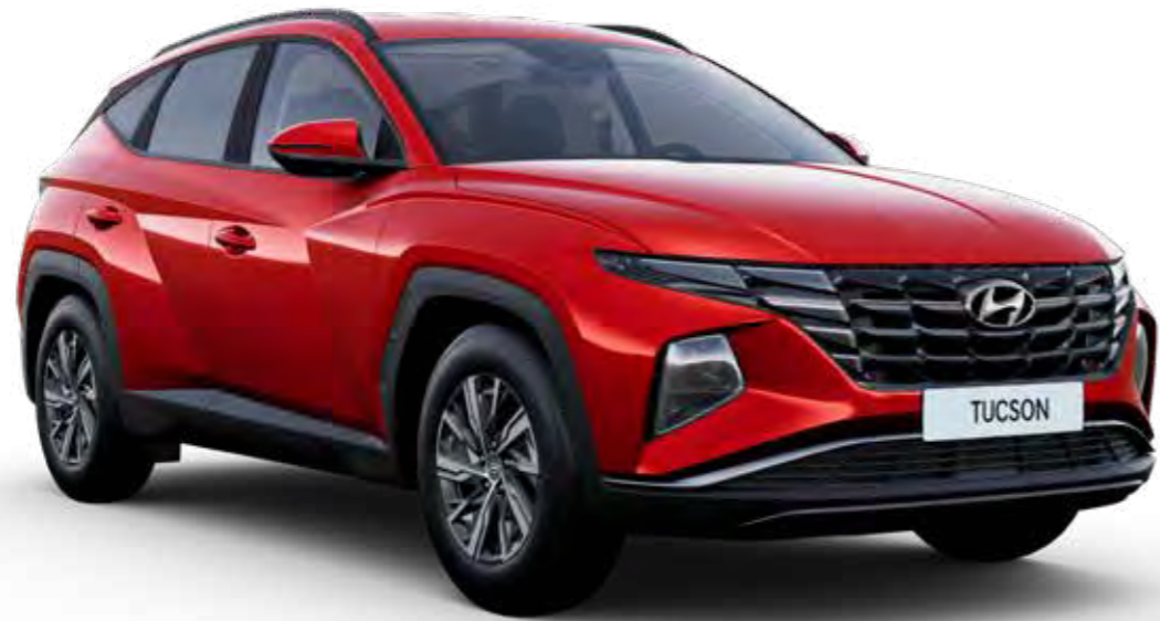
Car shown: TUCSON SE Connect in Engine Red Solid.