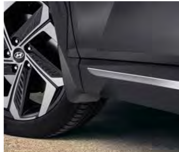
Front and Rear Mudguards.