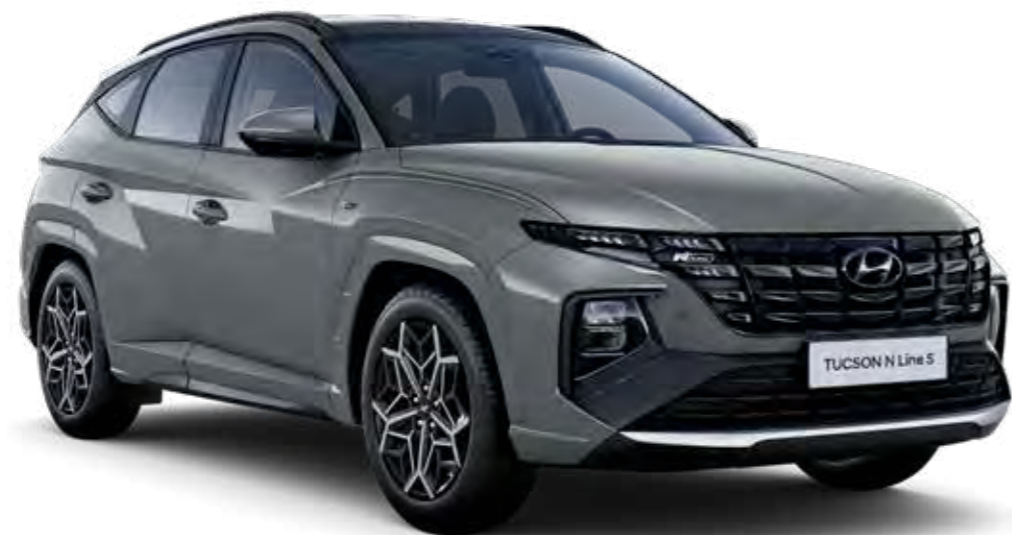
Car shown: TUCSON N Line S in Shadow Grey Solid.