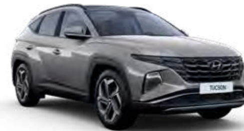
Shimmering Silver Metallic*