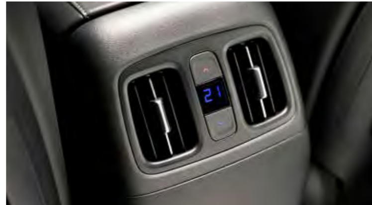
Three Zone climate control standard on Ultimate trim.