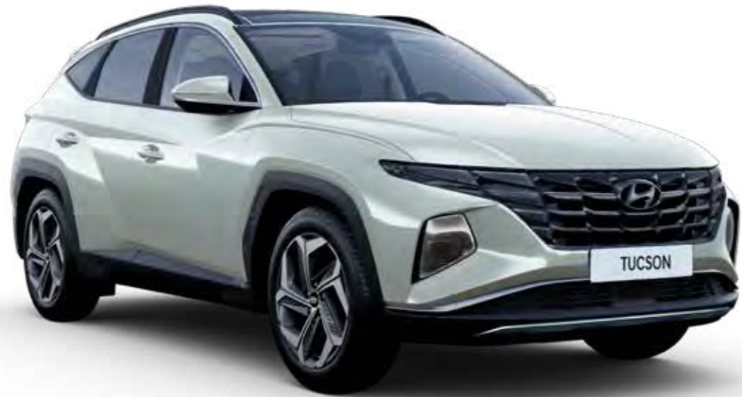
Car shown: TUCSON Hybrid Ultimate in Serenity White Pearl.