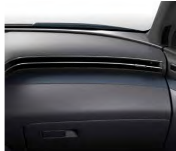
Black & Teal Dashboard Standard on Premium trim in Dark Teal Metallic with black two-tone roof and door mirror package.