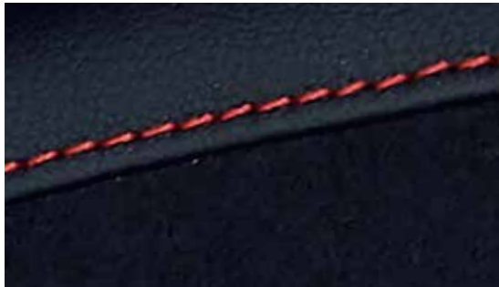
Black Leather & Suede Standard on N Line and N Line S trims.