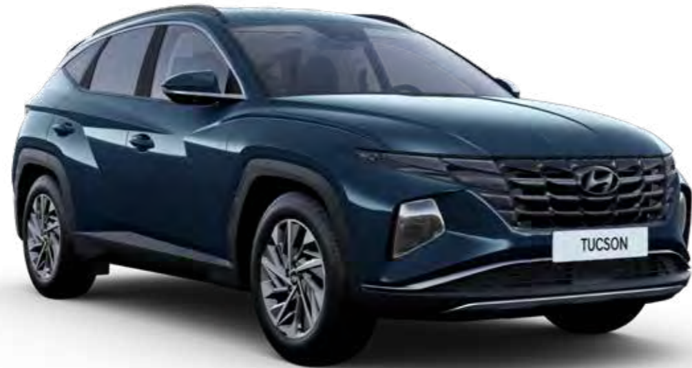
Car shown: TUCSON Premium in Dark Teal Metallic.