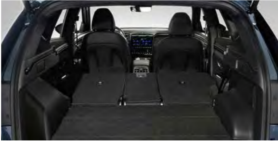
Remote folding rear seat function. Standard on Ultimate trim.