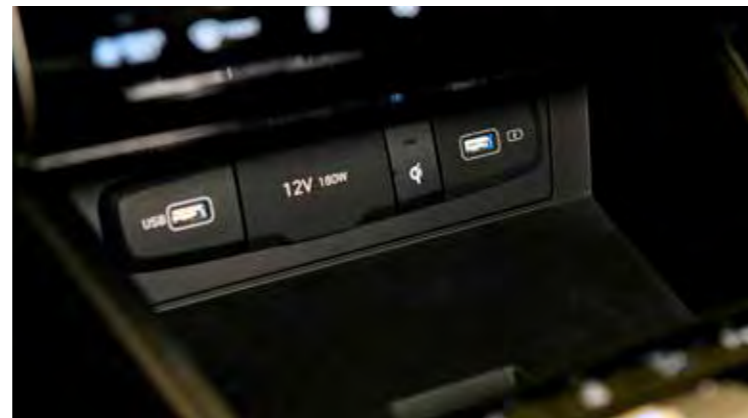
**Wireless phone charging pad not available on SE Connect trim.