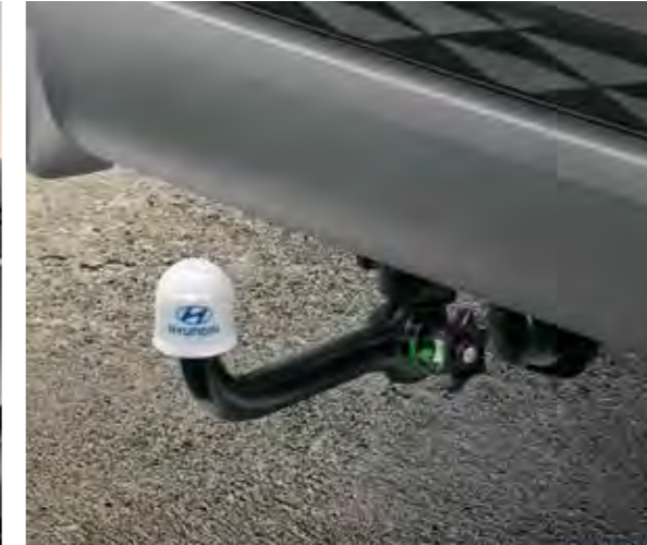
Fixed and Detachable towbar.