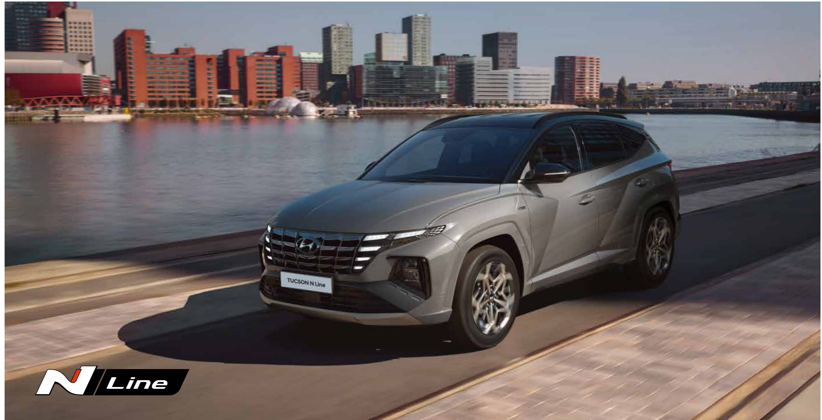
Car shown: TUCSON N Line in Shadow Grey Solid with optional Phantom Black Pearl two-tone roof. Car shown is not to UK Specification.

The TUCSON N Line combines style and enhanced sportiness. 19" alloy wheels feature distinctive parametric patterns. Black headlamp bezels compliment the dark chrome-effect grille. The body-coloured wheel arch mouldings and twin-tip sports exhaust complete the N Line look. Our designers have continued to set the pace inside. Upholstery that features a striking combination of suede and leather is enhanced by bold red stitching. The stylish N Line-branded steering wheel and alloy pedals further add to the sporting persona.