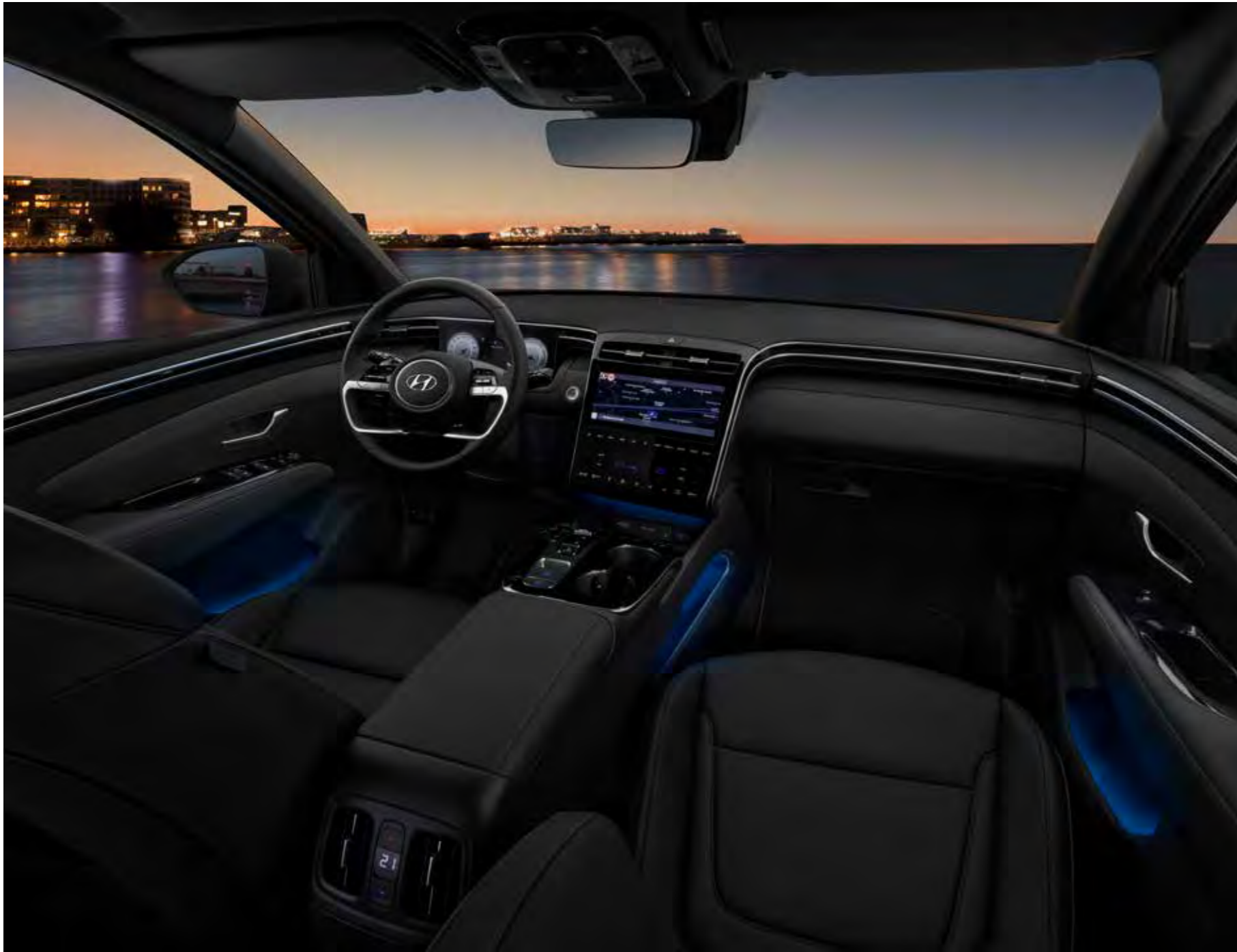
Car shown: TUCSON Hybrid Ultimate. Image shown is not to UK Specification.