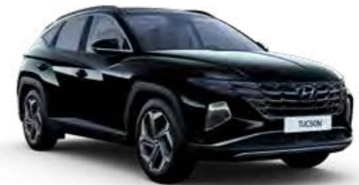
Abyss Black Pearl*