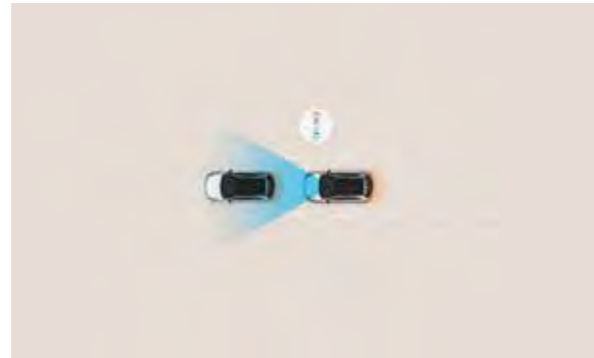
Forward Collision Avoidance (FCA): On detecting the risk of a collision ahead with a vehicle, pedestrian or cyclist, the driver is alerted to the danger, and if necessary, brakes are automatically applied to help prevent a frontal collision.