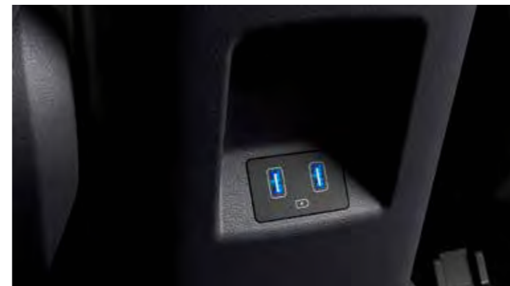
USB charger connections standard on all trims.