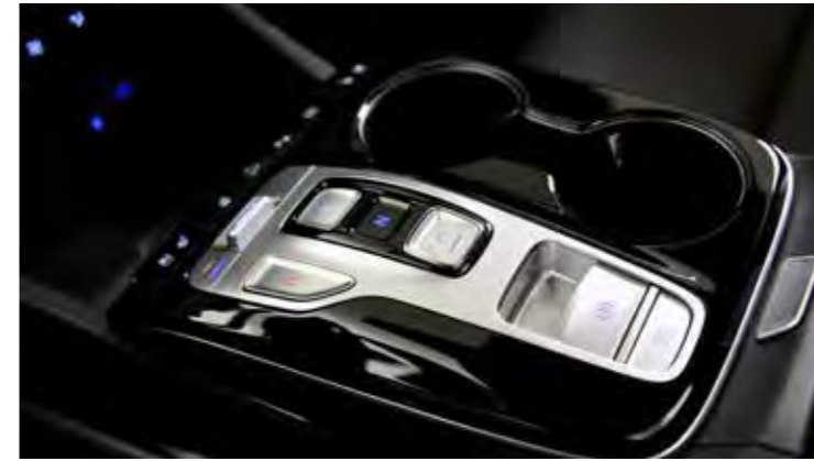
Shift by wire standard on all Hybrid trims.