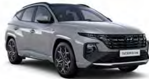
Shadow Grey Solid* Available on N Line and N Line S only.