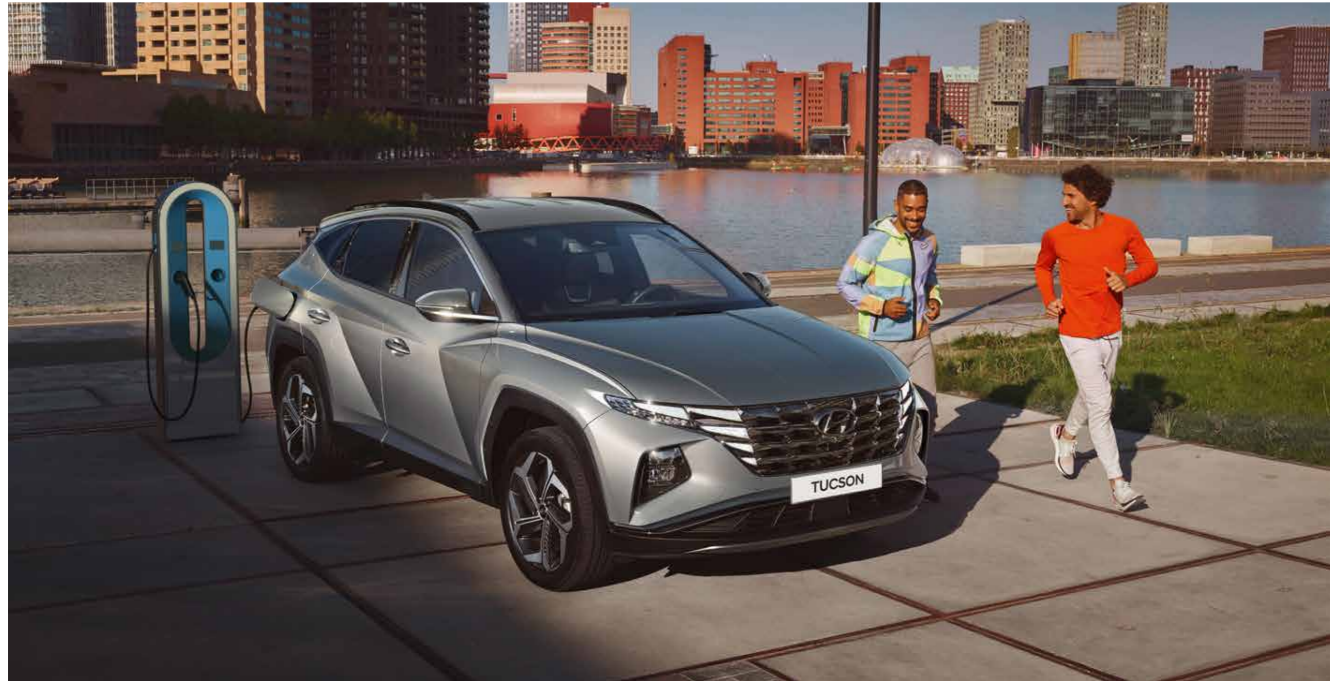
Car shown: TUCSON Plug-in Hybrid Premium in Shimmering Silver Metallic. Car shown is not to UK Specification.

*Estimated, subject to WLTP homologation.