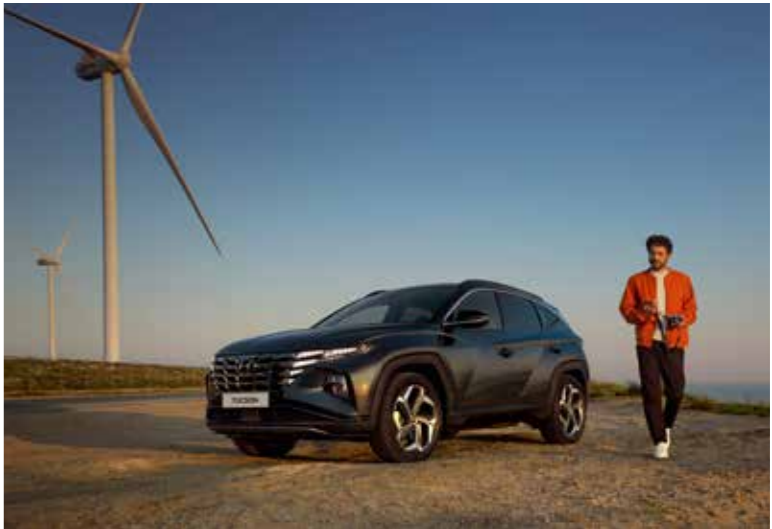
Car shown: TUCSON Hybrid Premium in Dark Teal Metallic. Car shown is not to UK Specification.

The TUCSON is about adventures together, plans made and plans delivered. A choice of powerful, efficient engines and technology that supports you. Advanced safety systems protect you beyond the bodywork, with sensors and cameras that alert you to danger. A fully connected in-car information system syncs with your smartphone.