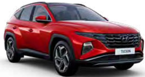
Engine Red Solid

Choose the right colour for you from our vibrant colour palette.