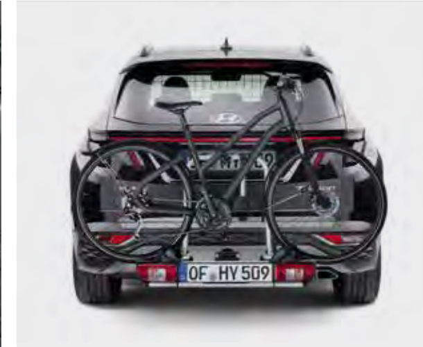
Towbar Mounted Bike Carrier.