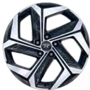
19" Alloy Wheels.