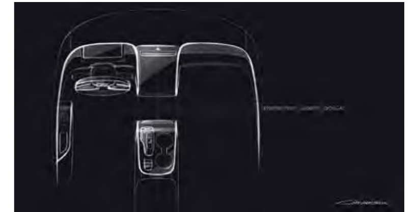
Original design sketches.

Elegance, comfort and style to put you in the right space.