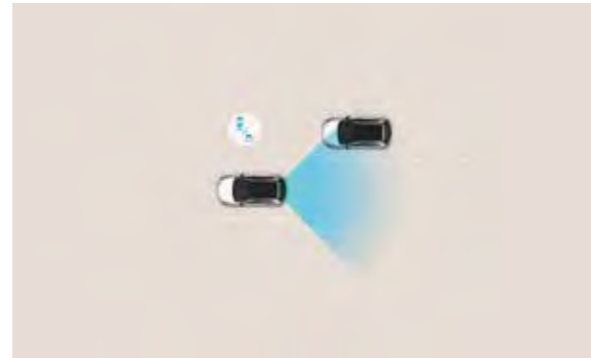
Blind-Spot Collision Warning (BCW): Radars detect traffic in the vehicle blind spot, warning drivers with an audible alarm when the indicator is used so you can be aware of the traffic around you even when you can't see it.