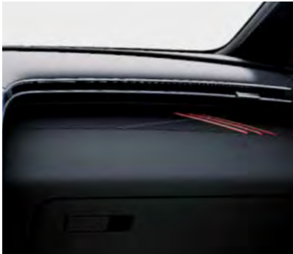
N Line Dashboard Standard on N Line and N Line S trim.