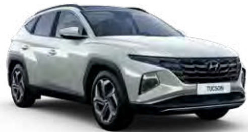
Serenity White Pearl*