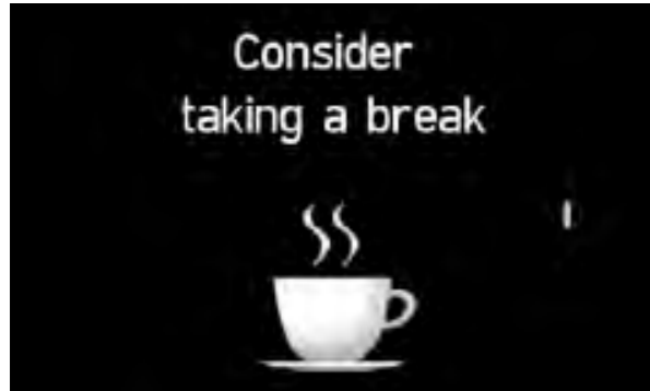
Driver Attention Warning (DAW): When a pattern of fatigue or distraction is identified, the system gets your attention with an alert and pop-up message suggesting a break.

With upgraded Smart Sense safety systems for all-round protection, safety is more than a priority.