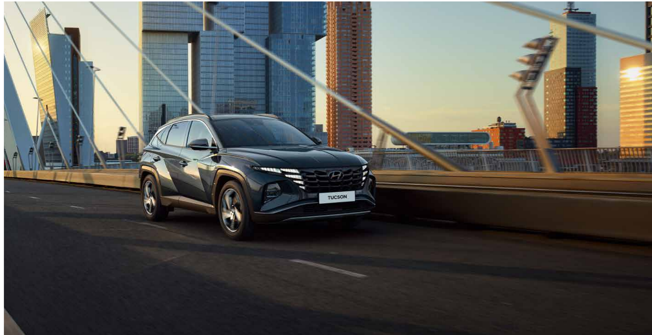
Car shown: TUCSON Hybrid Ultimate in Dark Teal Metallic. Car shown is not to UK Specification.

Outstanding progressive design doesn't just happen; it's crafted from the drawing board to the road. Since its launch in 2004, the TUCSON has continued to evolve in design and build, to reach this refined fourth generation model.