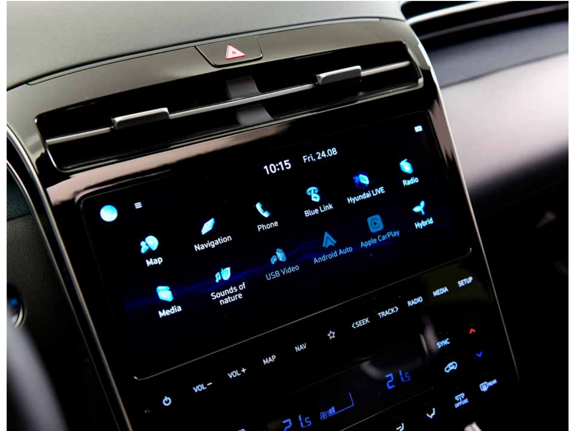
10.25" touchscreen audio visual navigation standard across all trim levels.