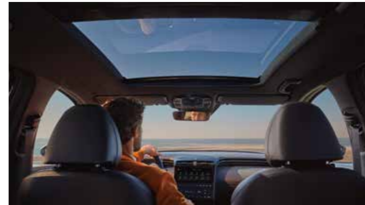
Panoramic glass sunroof standard on Ultimate trim.