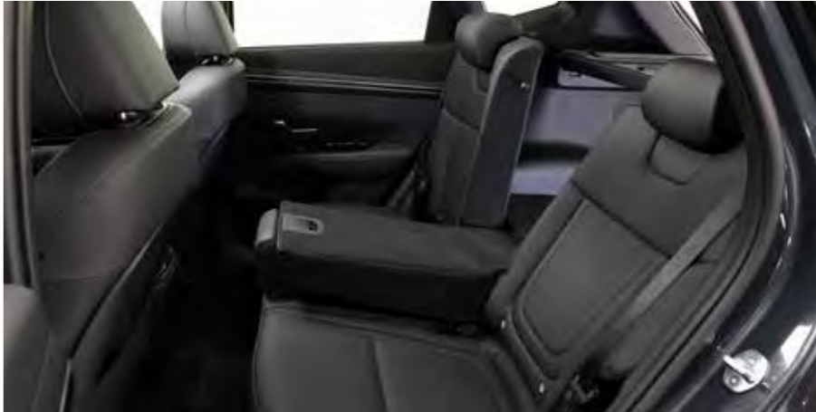
Split folding rear 40:20:40 seats standard across all trims.