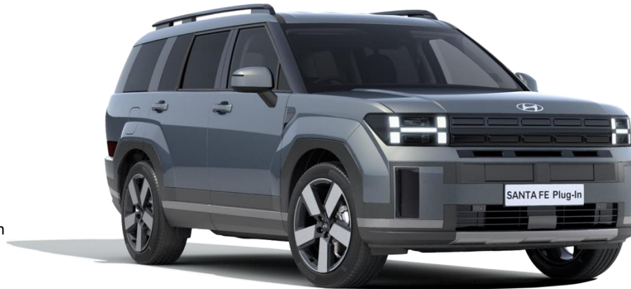
Example Car Hyundai SANTA FE Premium 1.6T 288PS Plug-in Hybrid 4WD Automatic