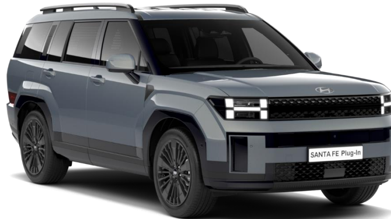
Example Car Hyundai SANTA FE Premium 1.6T 253PS Plug-in Hybrid 4WD Automatic