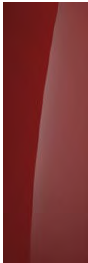
Ultimate Red (Metallic)*