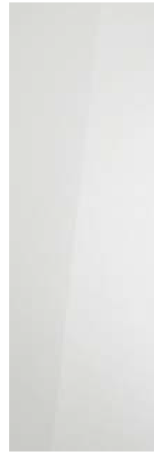
Atlas White (Solid)*