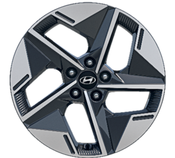
18" Alloy Wheel (Premium)