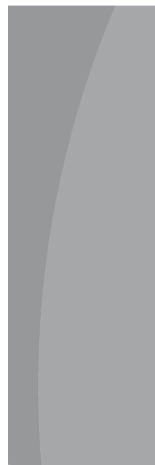
Shadow Grey (Solid)*