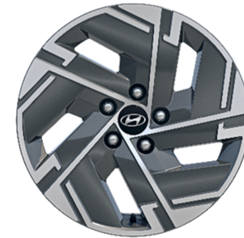
17" Alloy Wheel (Advance)