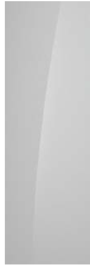
Serenity White (Pearl)*