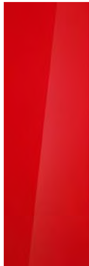
Engine Red (Solid)*