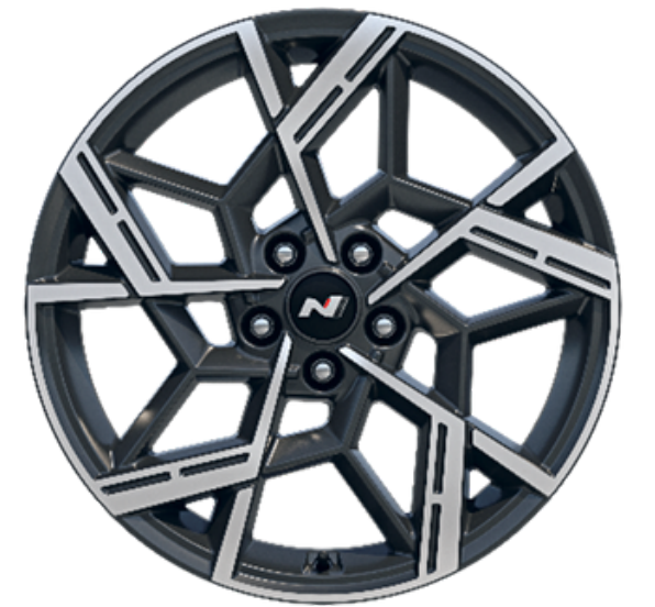
19" Alloy Wheel (N-Line and N-Line S)

*All colours are an additional cost option except for Engine Red (Solid).