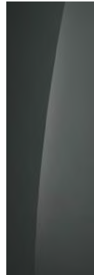
Cypress Green (Pearl)*