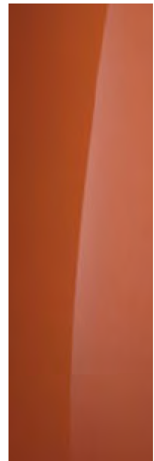
Jupiter Orange (Metallic)*