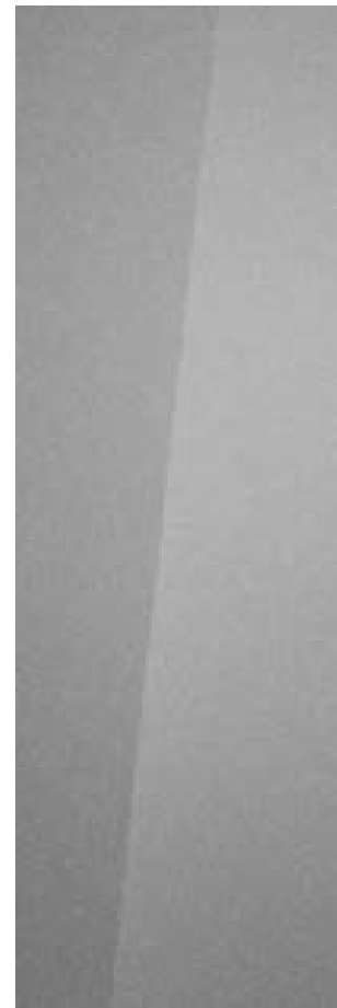
Shimmering Silver (Metallic)*