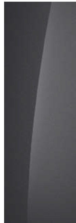
Ecotronic Grey (Pearl)*