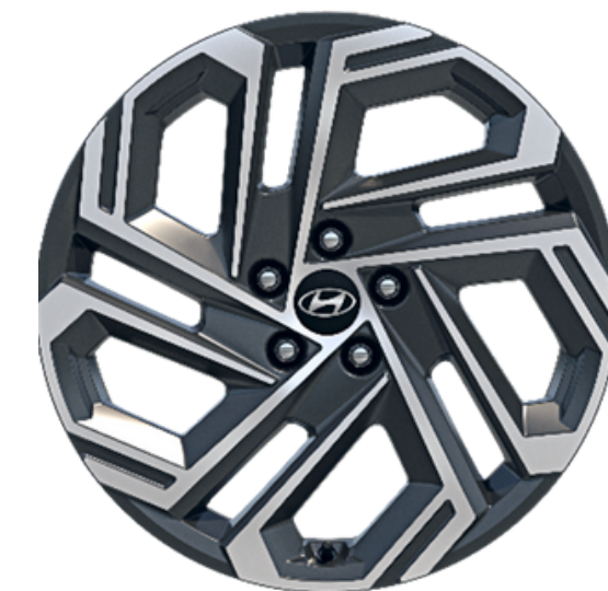
19" Alloy Wheel (Ultimate)