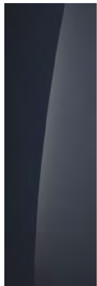
Sailing Blue (Pearl)*