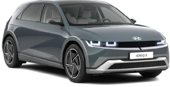
Digital Teal Green* (Pearl)