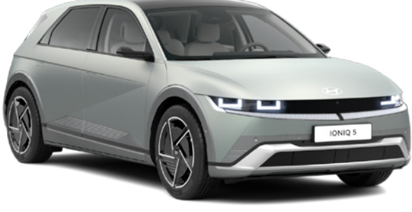
Celadon Grey* (Matte)

All colours are an additional cost option except from Ultimate Red (Metallic). *Colours only available on Advance, Premium and Ultimate.