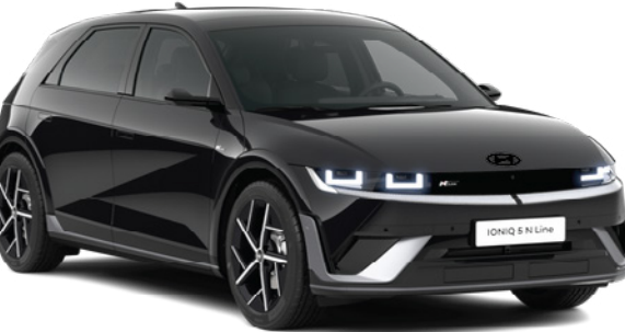
Abyss Black (Pearl)

Choose from a wide range of exterior colours to create an IONIQ 5 that is best matched to your personal style.