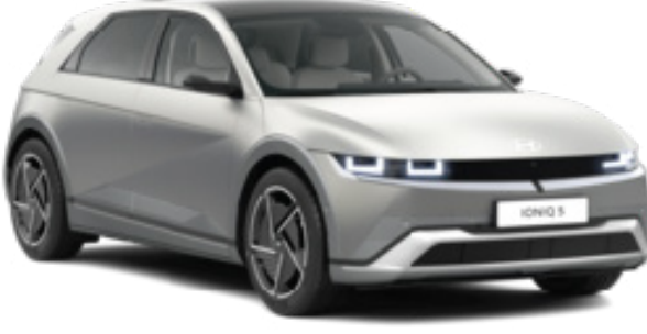
Gravity Gold* (Matte)