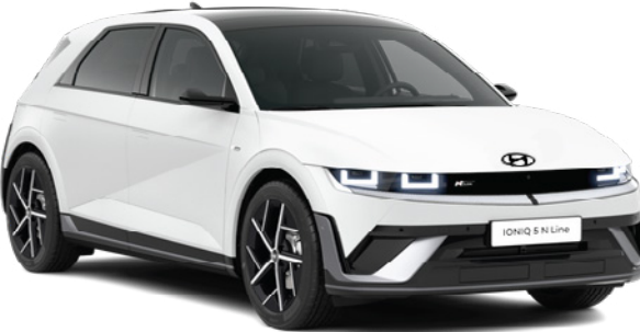
Atlas White (Matte)