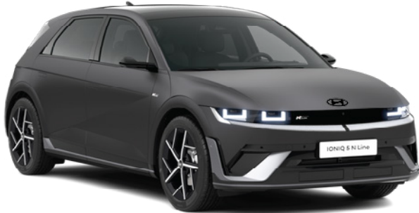
Ecotronic Grey (Matte)