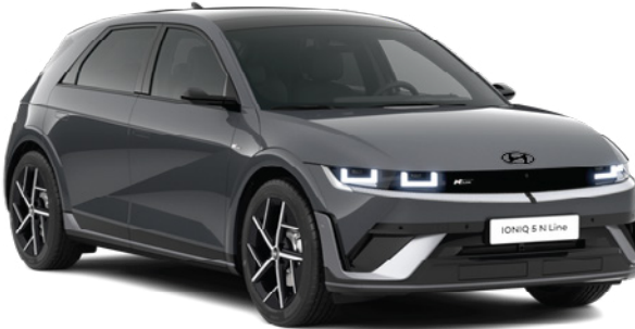
Ecotronic Grey (Pearl)