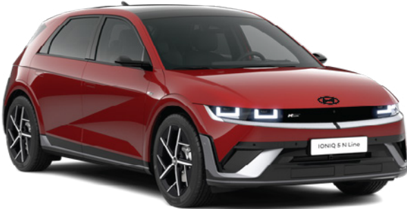
Ultimate Red (Metallic) (No cost option)