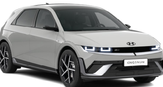
Cyber Grey (Metallic)