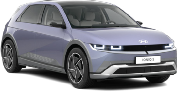
Meta Blue* (Pearl)